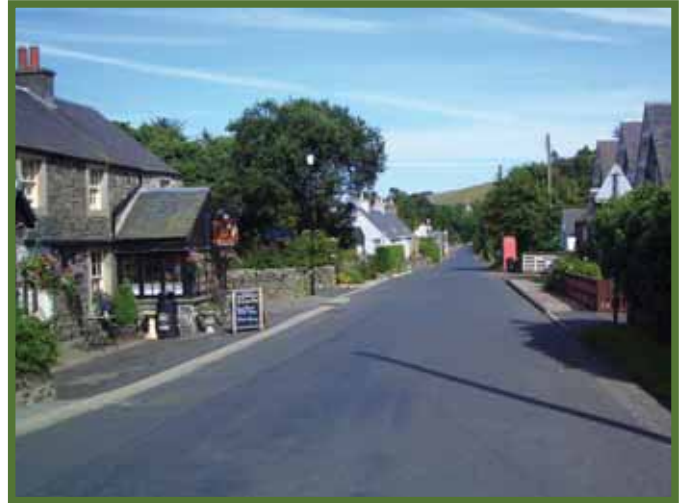
The pretty village of Ettrickbridge

3. Turn left and descend through the village, passing the Cross Keys Inn, back to the start.