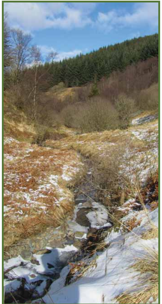
Gamescleuch Burn and Valley